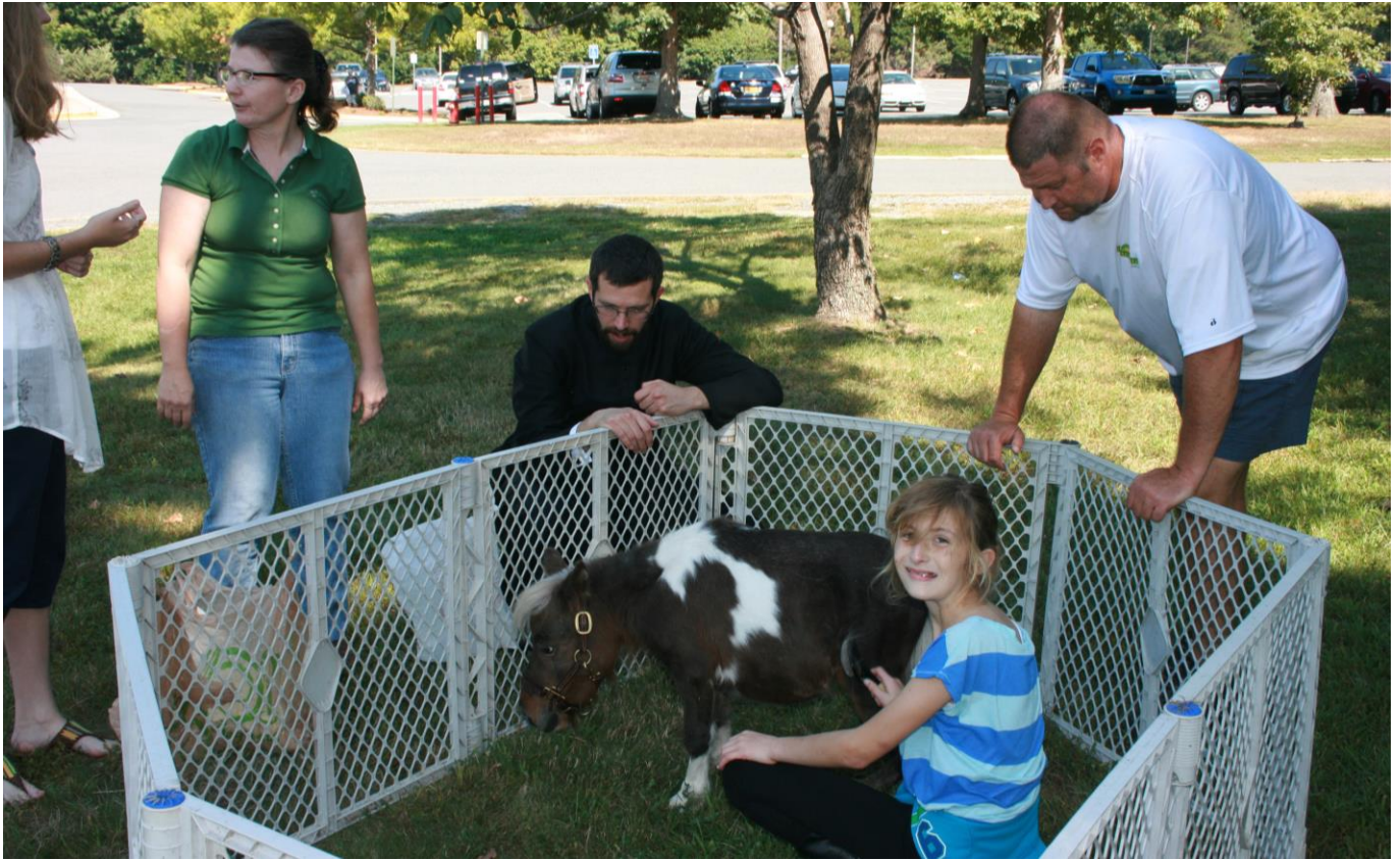
... and, was also enjoyed by adults!