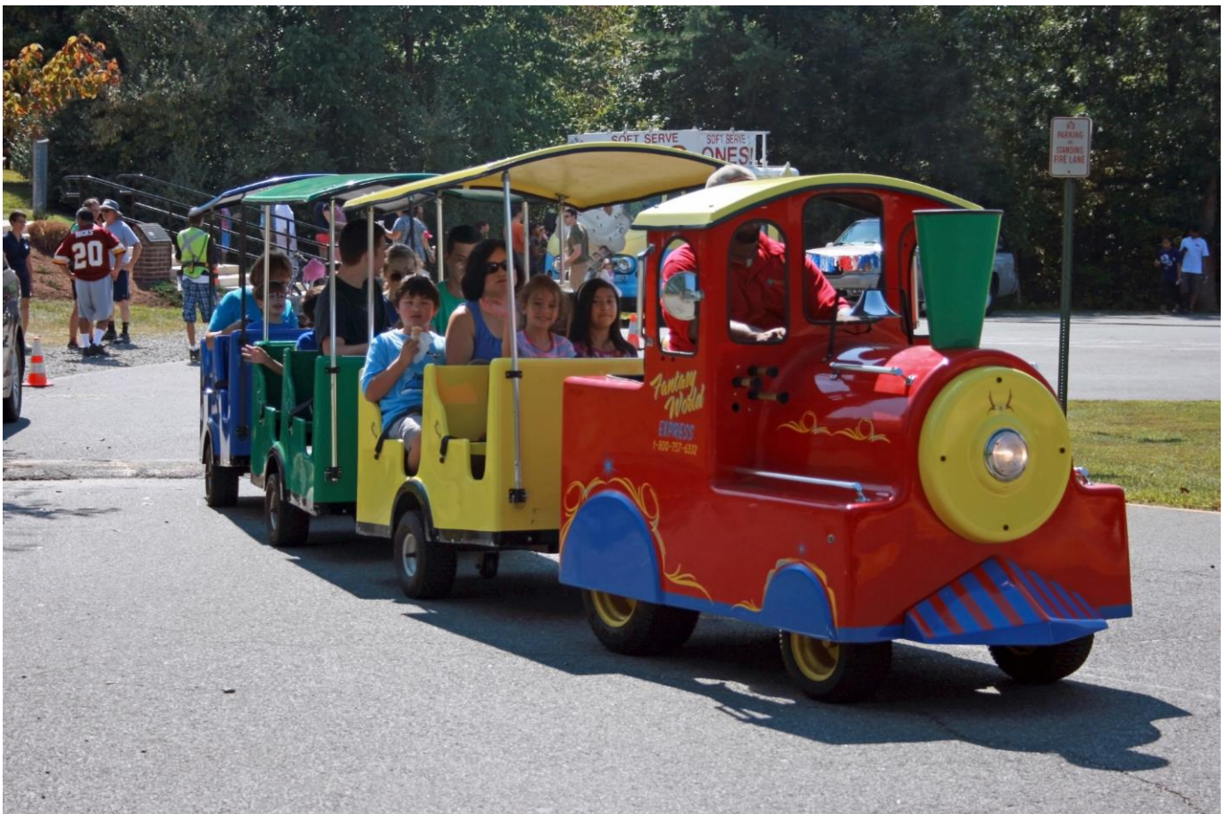
The "Train Ride" was a returning favorite again this year.