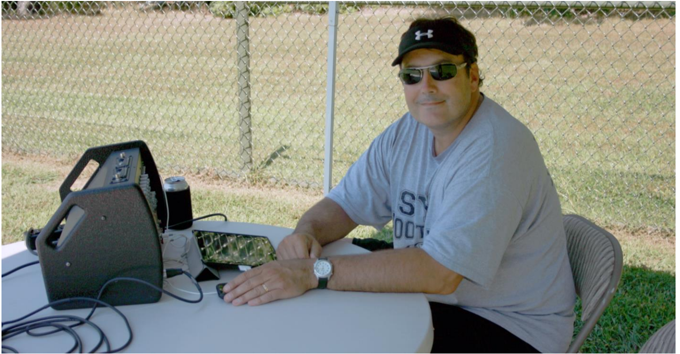
A DJ provided music for the entertainment of all.