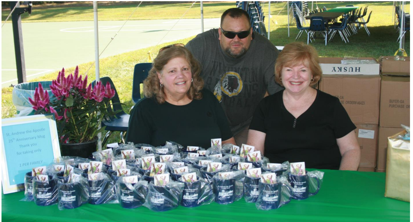
A commemorative coffee mug and a St. Andrew The Apostle holy card were provided to our parish families.