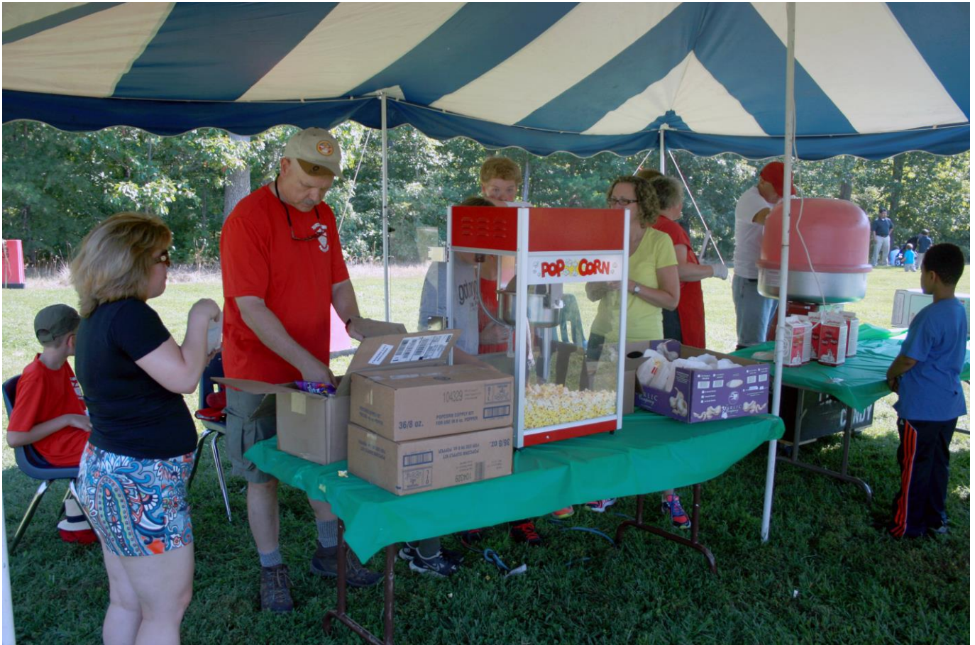
Although the “wait time” was significantly shorter, the Popcorn booth had its fans, too