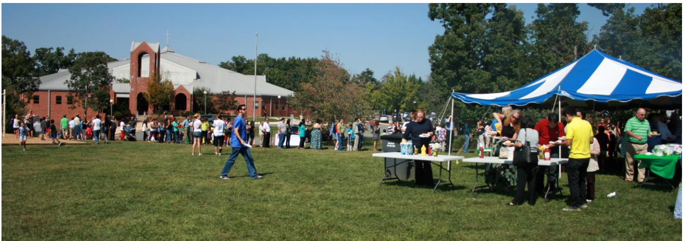
Lines for meals were long, but moved along well.