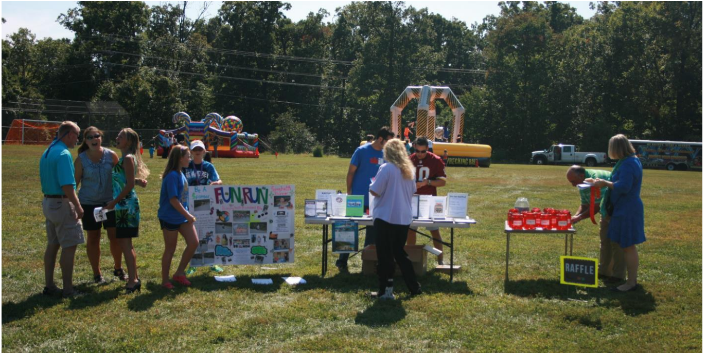
Raffle tickets sales and registration for the "Fun Run"