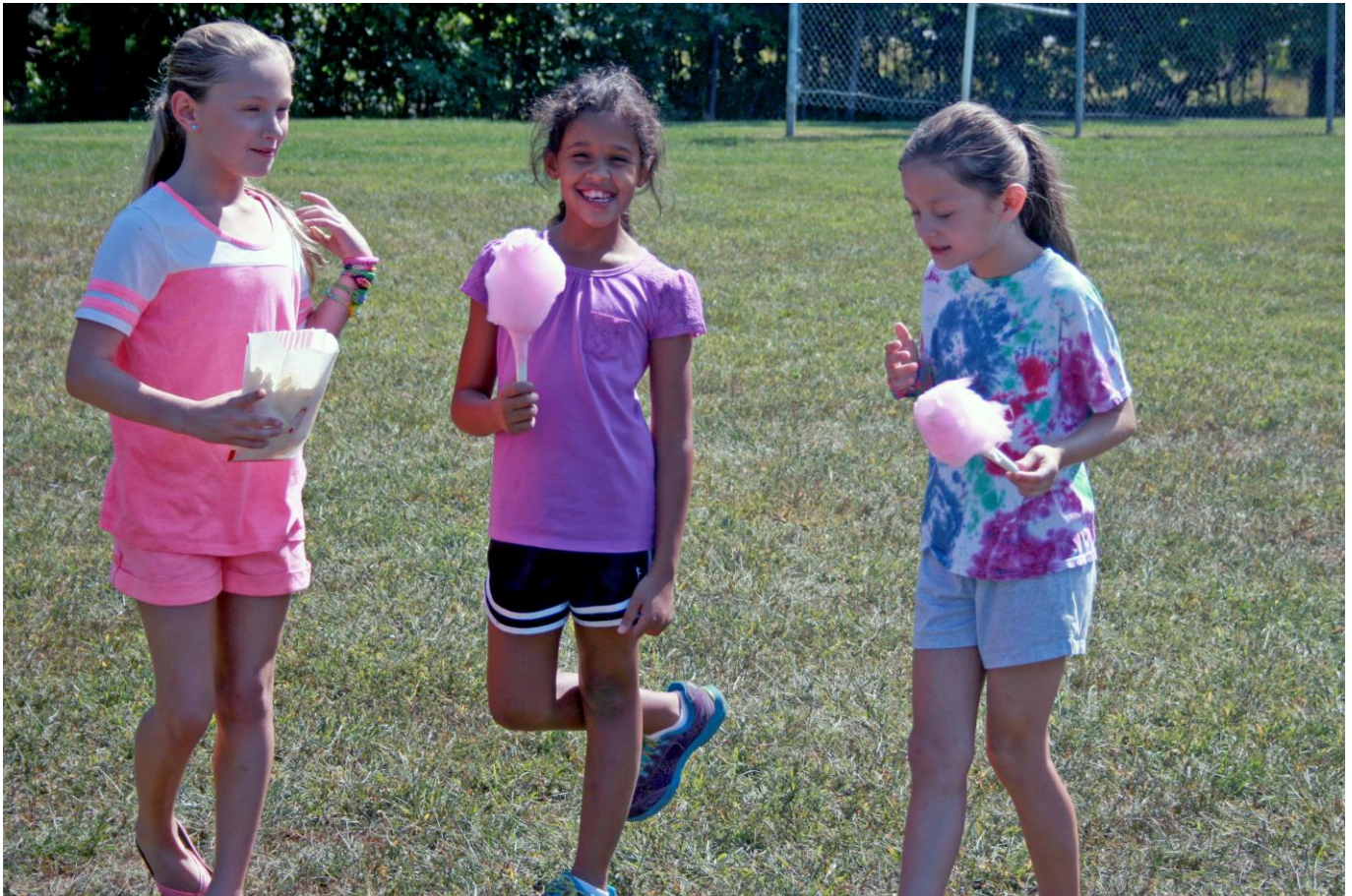
"Cotton Candy" is a perennial favorite!