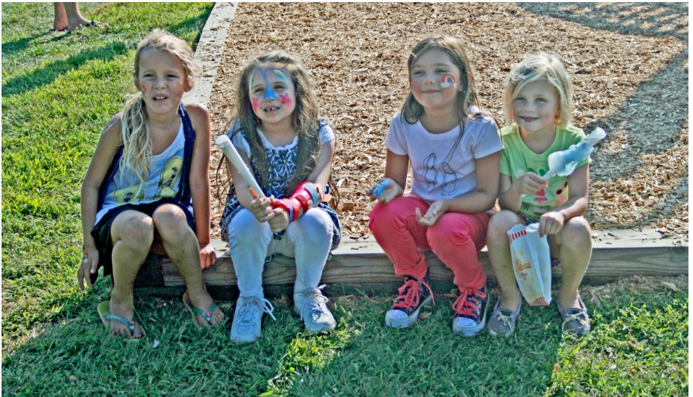
At the end of the afternoon, a good time was had by all!