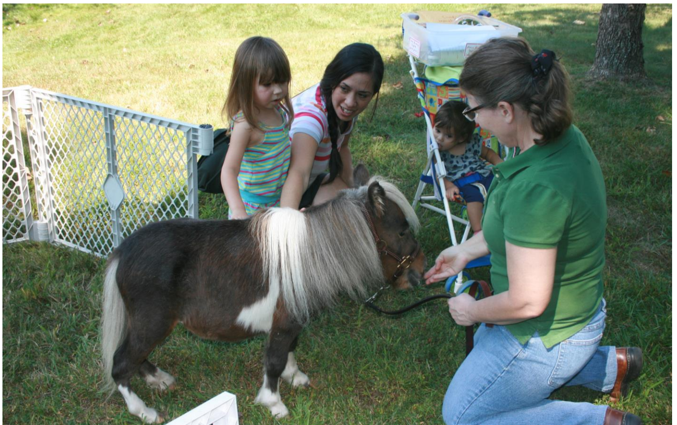
A miniature horse, named "Peanut", was a featured attraction for the children.