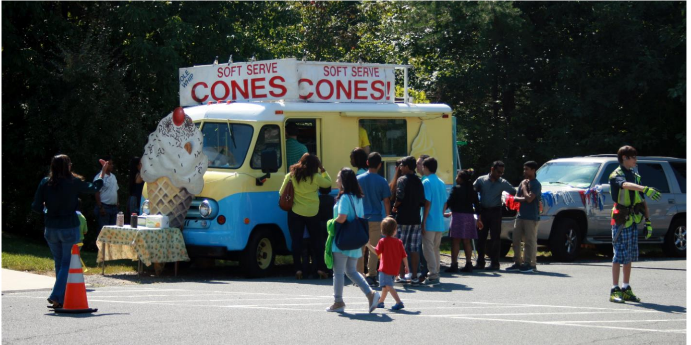
Soft-Serve ice cream cones were a picnic favorite!