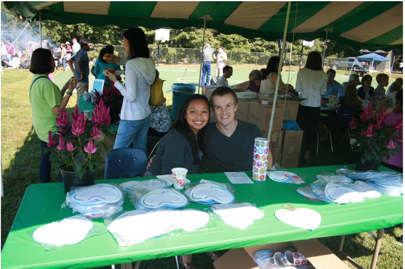
A Rosary "Craft Activity" table was sponsored by the youth Group.