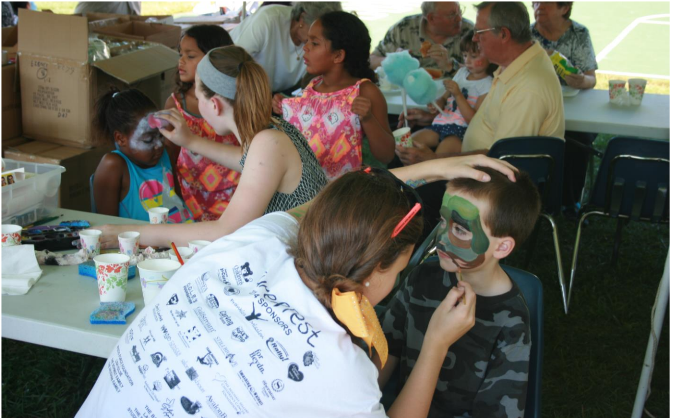
"Face-painting" also is a perennial favorite.